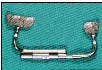
784 Space Maintainer