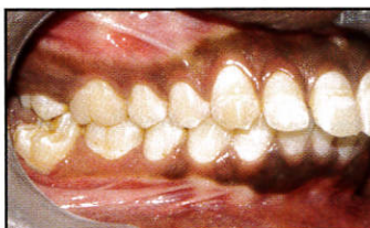
791 Posterior Crossbite