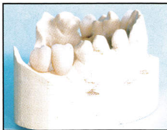
697 Adult Class III