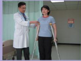
Professional physical therapy guide

Exclusive nursing and international service personnel